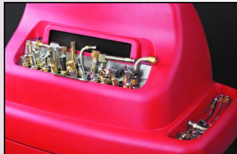
Adapters are conveniently stored in an organizer on back of machine.